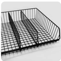
Wire Baskets with Dividers